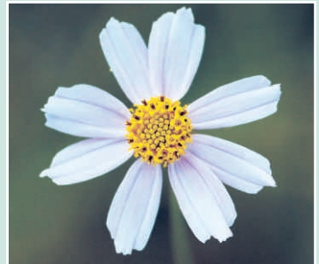
Daisy-like flower