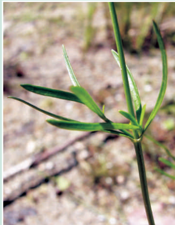
Narrow leaves and slender stem