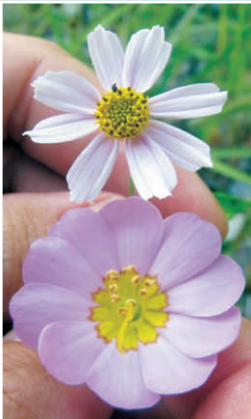
Pink Coreopsis - top, © MEGAN CROWLEY Plymouth Gentian - bottom

Similar species: Plymouth Gentian ( Sabatia kennedyana , page 27) has wider petals that are yellow at the base. Virginia Meadow-Beauty ( Rhexia virginica , page 26) has large yellow stamens and four petals.